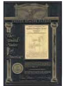
United States Patent No. 5,973,595